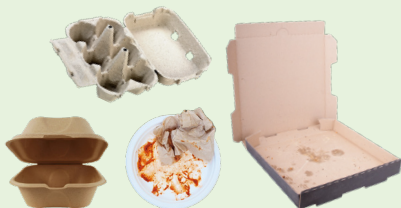
UNCOATED SOILED PAPER