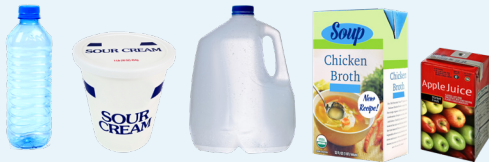
PLASTIC BOTTLES, TUBS AND JUGS (plastic containers #1 – #7 and aseptic containers)