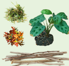
YARD WASTE (branches less than 3' long and 3" thick)