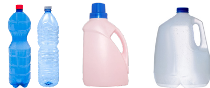
PLASTIC BOTTLES, TUBS, AND JUGS BOTELLAS, BALDES Y JARRAS DE PLÁSTICO