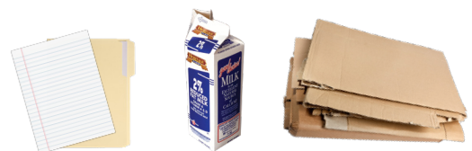
PAPER, FLATTENED CARDBOARD, AND CARTONS PAPEL, CARTÓN PLANO Y CARTONES