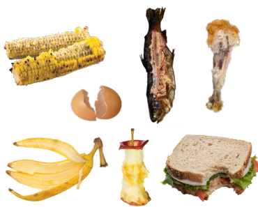
FOOD SCRAPS RESTOS DE COMIDA