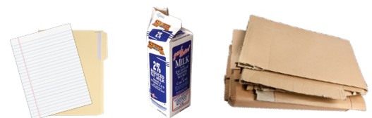
PAPER, FLATTENED CARDBOARD, AND CARTONS PAPEL, CARTÓN PLANO Y CARTONES