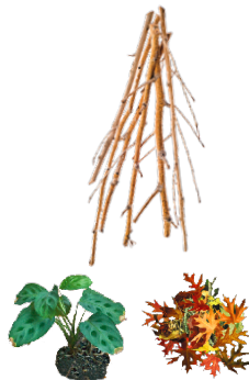
PLANT TRIMMINGS DESECHOS DE JARDÍN