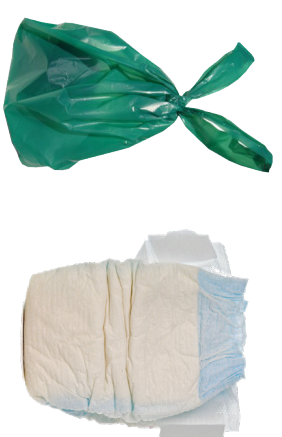
BAGGED ANIMAL WASTE AND DIAPERS