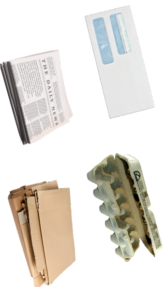
CLEAN PAPER AND CARDBOARD