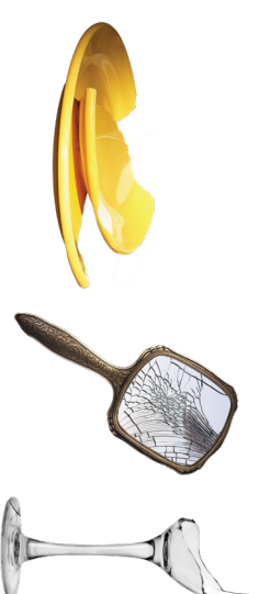
CERAMICS AND MISC. GLASS