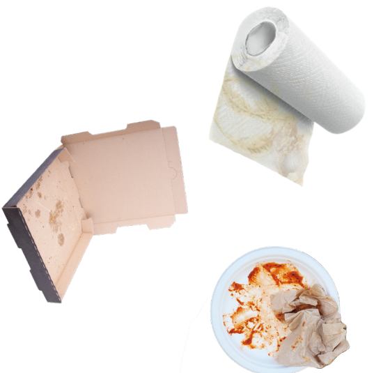
UNCOATED FOOD-SOILED PAPER PRODUCTS