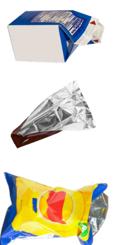
SNACK BAGS, WRAPPERS, PAPER CUPS, AND CARTONS