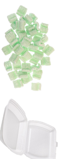
PACKAGING AND POLYSTYRENE FOAM