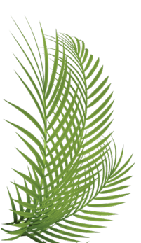
OLEANDER, POISON OAK, AND PALM TREES