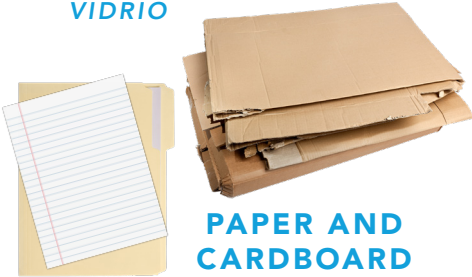
PAPER AND CARDBOARD PAPEL Y CARTÓN