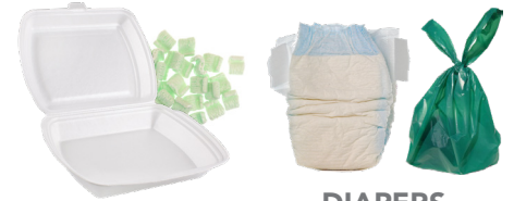
PACKAGING FOAM AND POLYSTYRENE EMBALAJE Y FORMA DE PLIESTIRENO