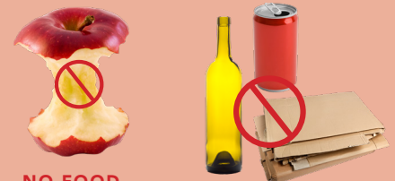
NO FOOD COMIDA NO