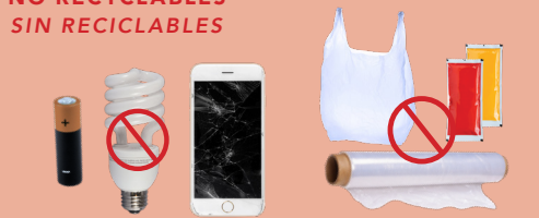
NO HAZARDOUS OR ELECTRONIC WASTE DESECHOS PELIGROSOS O ELECTRÓNICOS NO