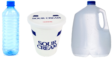
PLASTIC BOTTLES, TUBS, JUGS BOTELLAS, BALDES Y JARRAS DE PLÁSTICO