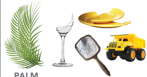
PALM FRONDS HOJAS DE PALMA