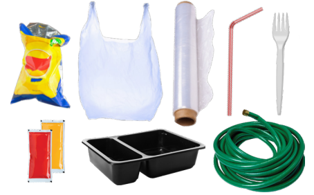
SINGLE-USE & BLACK PLASTIC, HANGERS, AND HOSES PLÁSTICO DE UN SOLO USO Y PLÁSTICO NEGRO, PERCHAS Y MANGUERAS