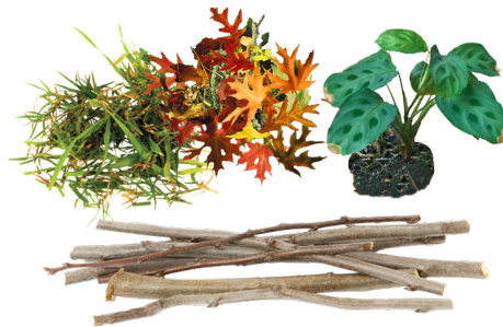
YARD WASTE DESECHOS DE JARDÍN