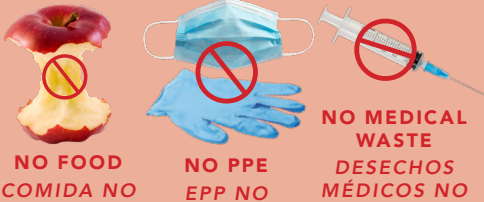
NO FOOD COMIDA NO