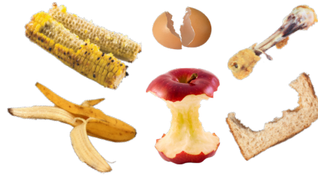
FOOD SCRAPS RESTOS DE COMIDA