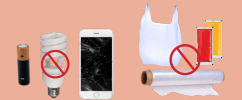
NO HAZARDOUS OR ELECTRONIC WASTE DESECHOS PELIGROSOS O ELECTRÓNICOS NO