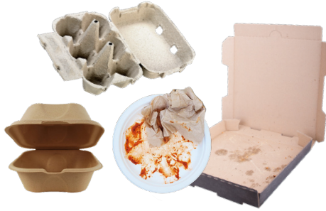
UNCOATED SOILED PAPER PAPEL SUCIO SIN RECUBRIMIENTO