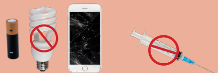
NO HAZARDOUS OR ELECTRONIC WASTE DESECHOS PELIGROSOS O ELECTRÓNICOS NO