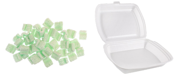
PACKAGING FOAM AND POLYSTYRENE