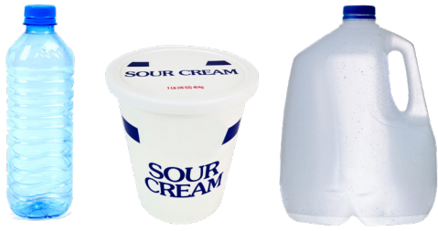
PLASTIC BOTTLES, TUBS, AND JUGS