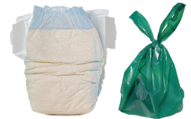
DIAPERS AND PET WASTE