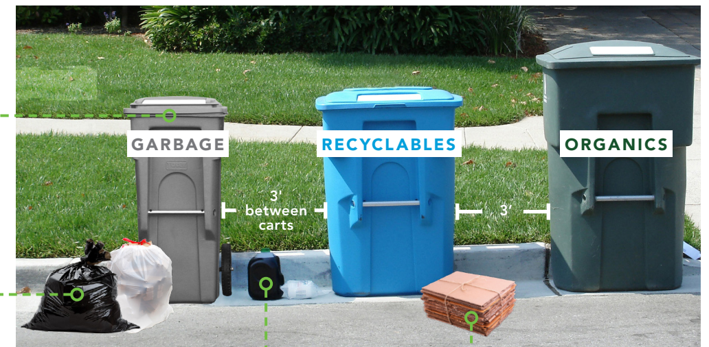
Used oil and filters bagged and sealed.

Extra trash bags accepted for additional fee. Schedule at 707.552.3110.