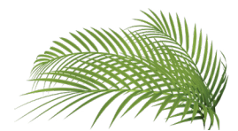
OLEANDERS AND PALM FRONDS