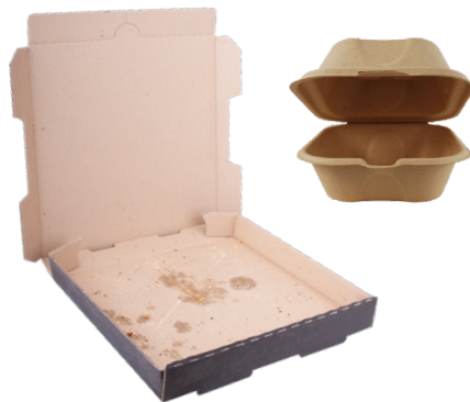
UNCOATED SOILED PAPER