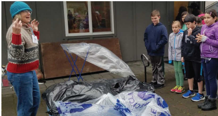
Participating in school events.