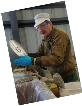
Working on the recycled paint program.

Get involved in a variety of projects in their efforts to raise community awareness and educate others.