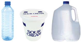
PLASTIC BOTTLES, TUBS, AND JUGS