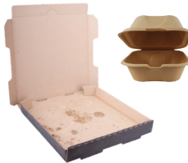
UNCOATED SOILED PAPER