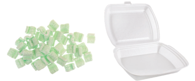
PACKAGING FOAM AND POLYSTYRENE