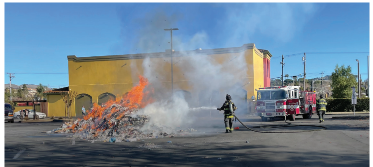
Vallejo firefighters put out a blaze that started in a Recology truck probably by batteries or other discarded household hazardous waste.

The Recology Vallejo-American Canyon BOPA (Batteries, Oil, Paint, Antifreeze) Recycling Facility,