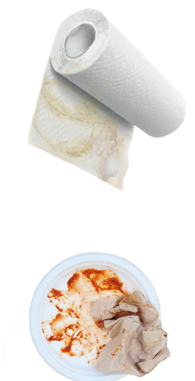
UNCOATED FOOD-SOILED PAPER PRODUCTS