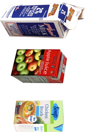
CARTONS AND ASEPTIC PACKAGING