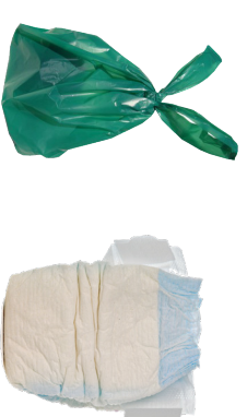
BAGGED ANIMAL WASTE AND DIAPERS