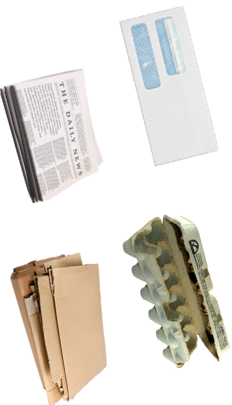
CLEAN PAPER AND CARDBOARD