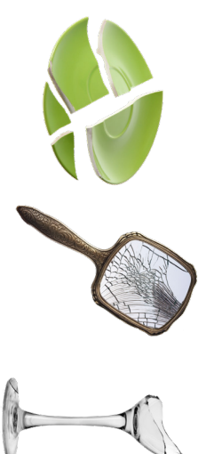
CERAMICS AND MISC. GLASS