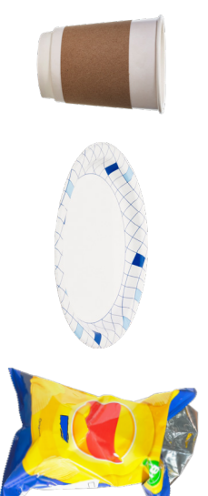
SNACK BAGS, WRAPPERS, AND COATED PAPER PRODUCTS